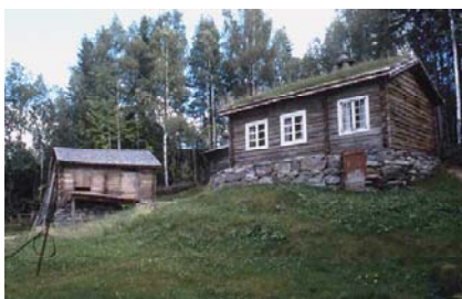
Maihaugen open air museum

The executive board of the ESFR has decided that the 6th ESFR Congress should take place in Lillehammer, Norway between the 26th and the 29th September 2012. The Conference theme will be announced at the 2010 conference in Milan.